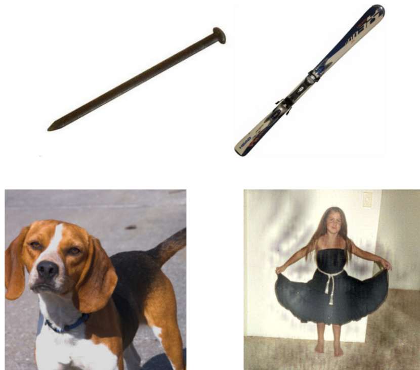
Figure 3. Collisions of the NeuralHash function extracted from iOS 14. Top: A pair of accidentally colliding images in the ImageNet database of 14 million sample images; Bottom: An artificially constructed pair of colliding images.